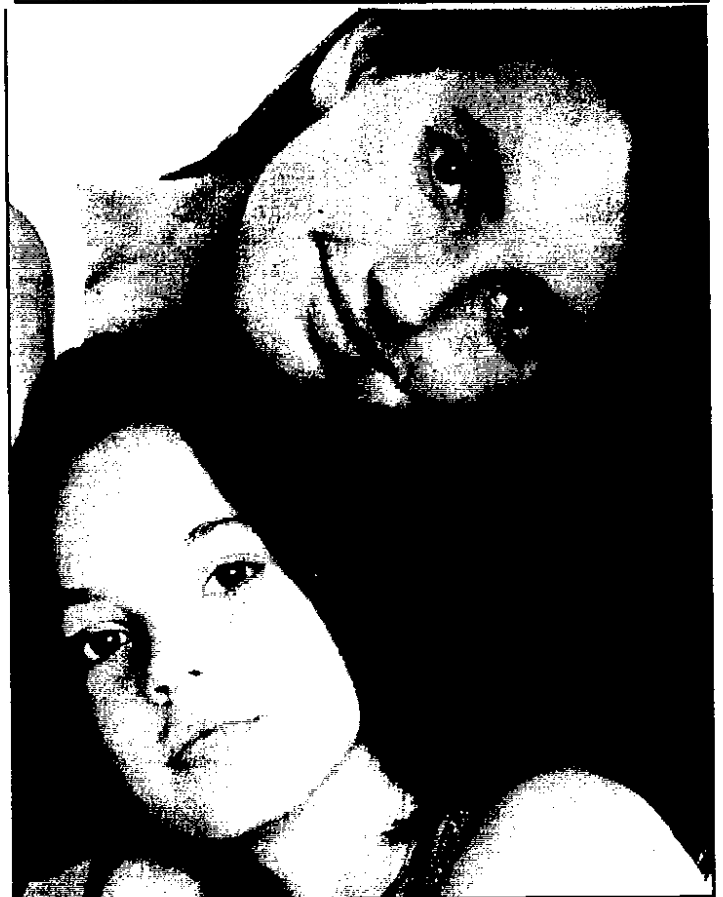
Proudest Mom and Dad in th-world!